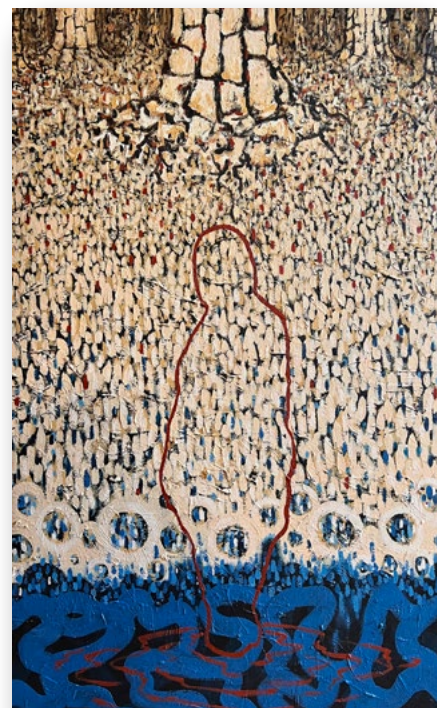
The Snowflake Atlas: Case 52

"The snowflake atlas: case 52" is part of a large, ongoing series populated by shadowy silhouettes of figures roaming partially submerged, primordial western landscapes from hazily-remembered childhood journeys merging with Zen Buddhist stories of time and being. The silhouetted figure emerging from the watery ground is set against the earthy landscape of silent Ponderosas standing sentinel over the vibrant complexity of life on the forest floor. Effective leaders are adaptable and attuned to their environment, responsive to changing conditions and people, like the central figure.